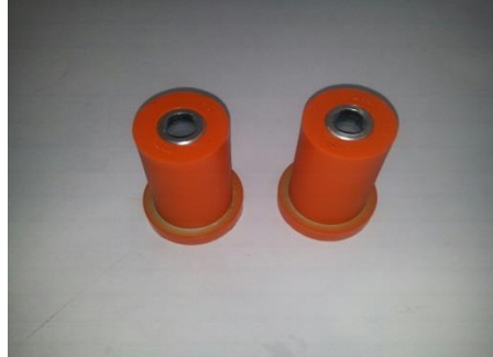
2x 1BM Polyurethane Pieces and 2x 1BM Tubes

The bush should be fitted on the wishbone such as the flange faces the front of the car.